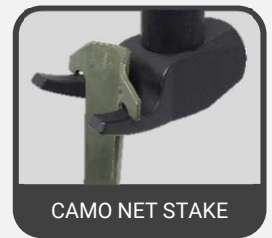
CAMO NET STAKE