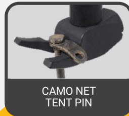
CAMO NET TENT PIN