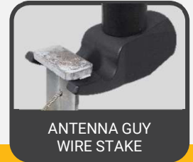
ANTENNA GUY WIRE STAKE